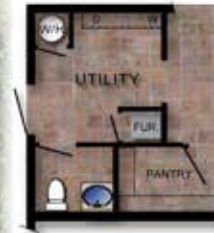
OPTIONAL 1/2 BATH